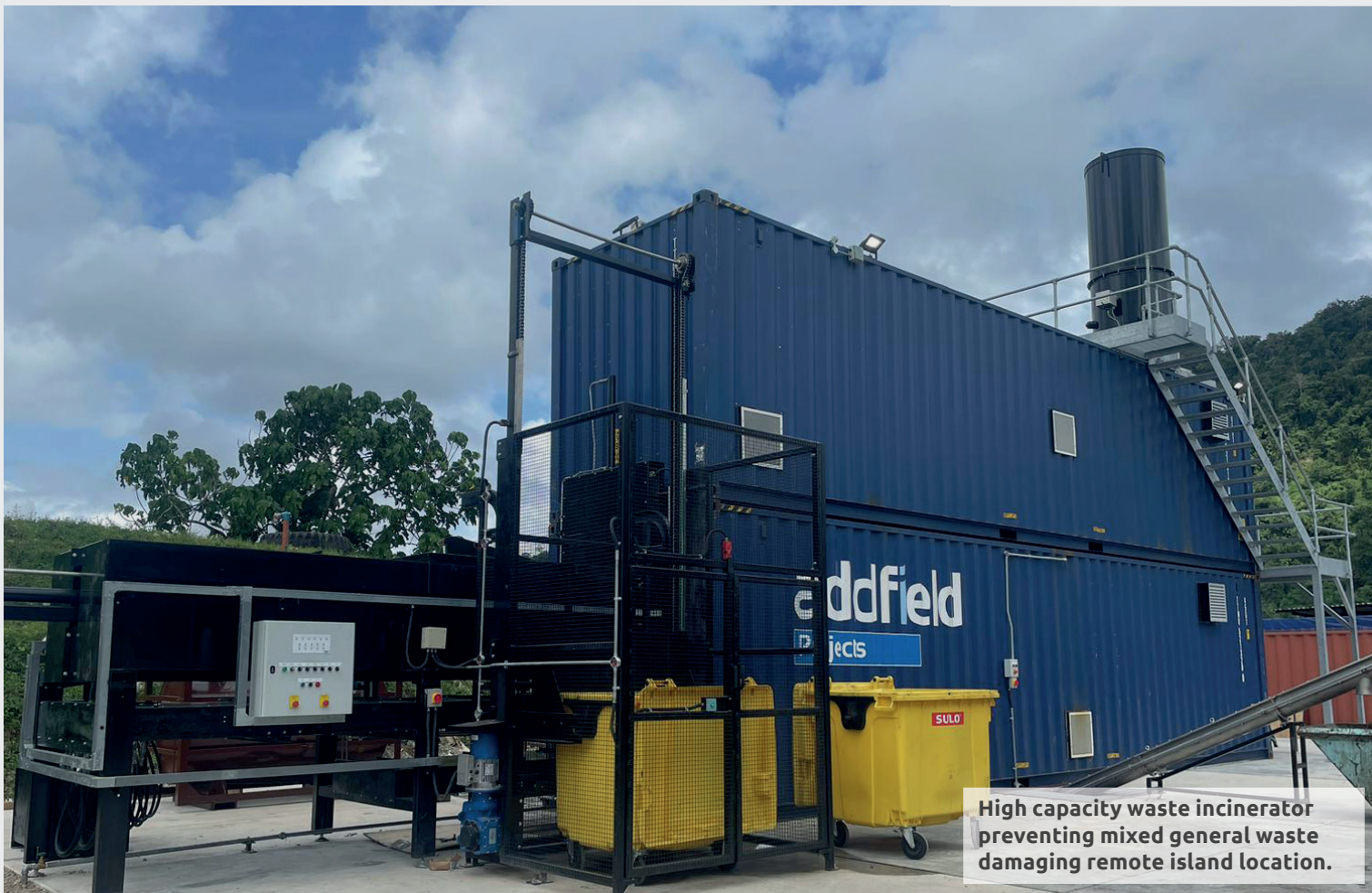
High capacity waste incinerator preventing mixed general waste damaging remote island location.

We are incredibly proud of the impact we have had in the past 40 years and will continue with our motto of being, 'Simply Built Better'.