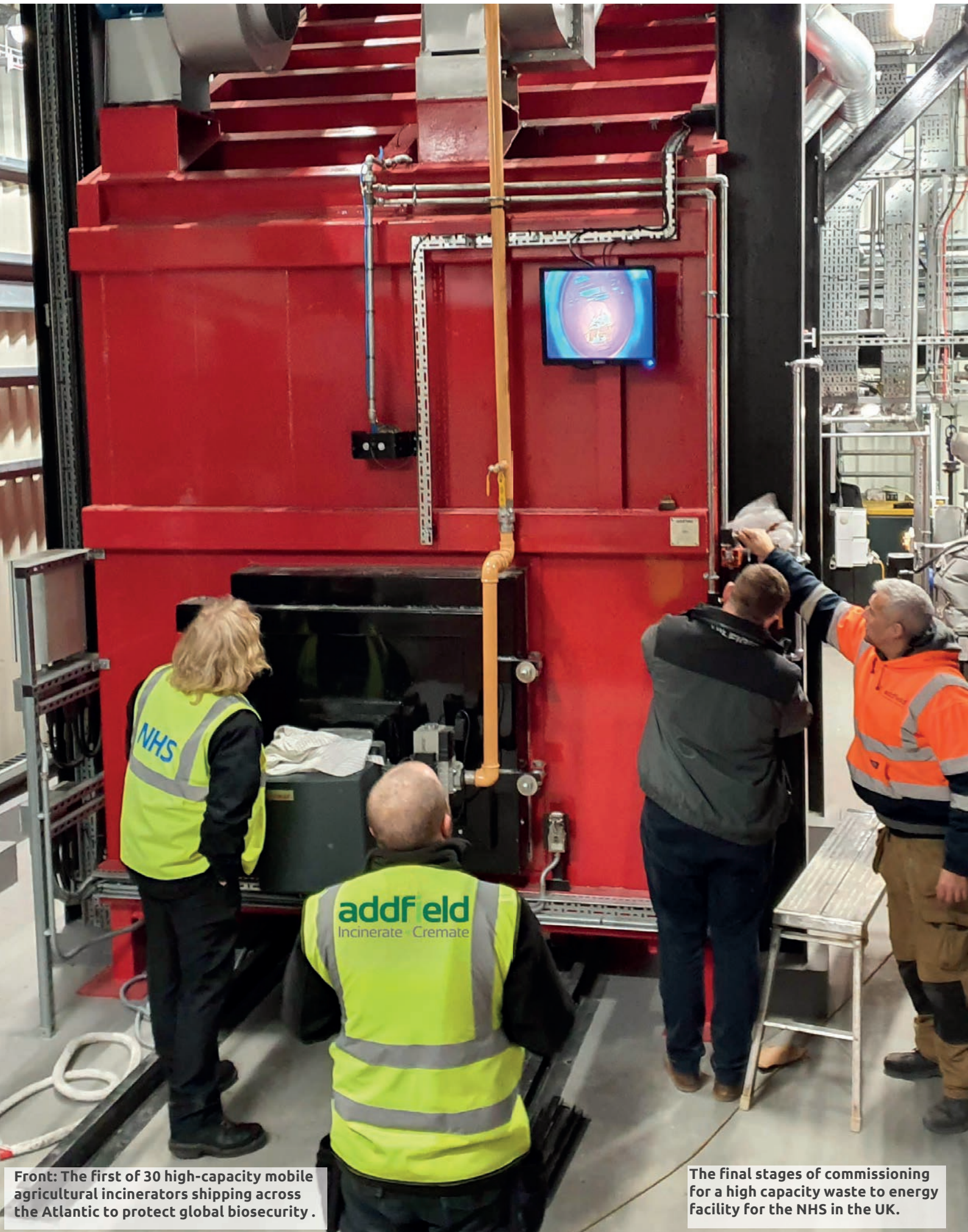
Front: The first of 30 high-capacity mobile agricultural incinerators shipping across the Atlantic to protect global biosecurity .