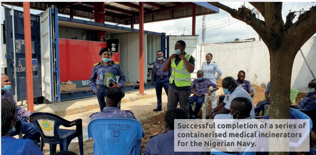
Successful completion of a series of containerised medical incinerators for the Nigerian Navy.

When the current leadership team took control in 2008 Addfield only produced a handful of machines a year for the UK agricultural market. Since then we have expanded from having only three employees to over seventy through sustainable growth. This has been achieved through expanding into new markets and countries gradually. Each expansion is scrutinised for impact on the business and future potential, avoiding growing too fast into immature markets.