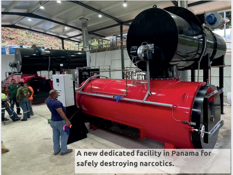
A new dedicated facility in Panama for safely destroying narcotics.