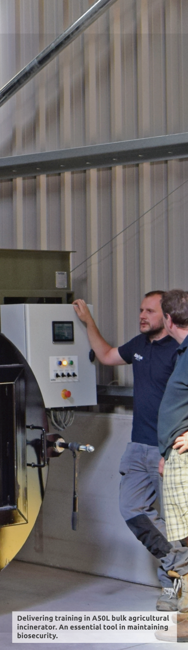
Delivering training in A50L bulk agricultural incinerator. An essential tool in maintaining biosecurity.