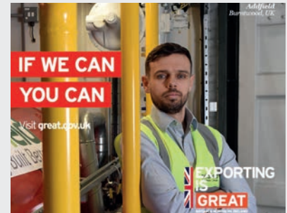
Active members of the DIT Exporting Champions project since 2019.

Proud of the impacts we have seen achieved through exporting. We had this validated in 2018 by the Department of International Trade (DIT), receiving the Board of Trade award. Following which we have become ambassadors for the DIT since 2019 as part of their exporting champions program. Mentoring businesses across the West Midlands, delivering workshops supporting them to begin exporting, sharing our experiences helping to amplify the