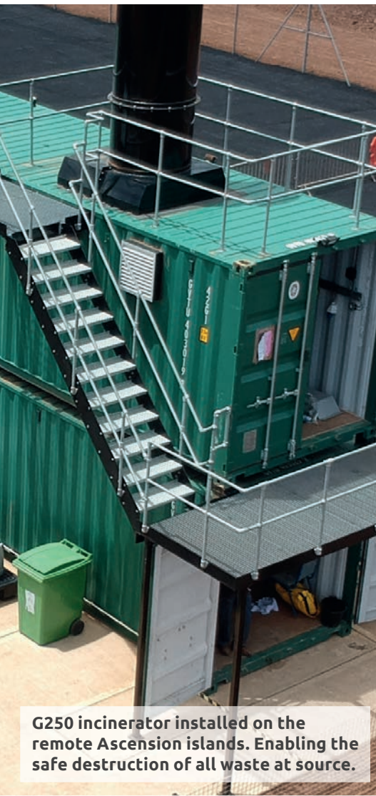
G250 incinerator installed on the remote Ascension islands. Enabling the safe destruction of all waste at source.