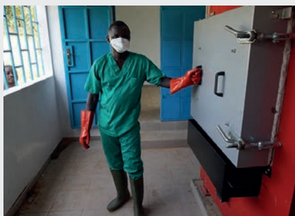
Safe to operate throughout the cycle

When the current leadership team took control in 2008 Addfield only produced a handful of machines a year for the UK agricultural market. Since then we have expanded from having only three employees to over seventy through sustainable growth. This has been achieved through expanding into new markets and countries gradually. Each expansion is scrutinised for impact on the business and future potential, avoiding growing too fast into immature markets.