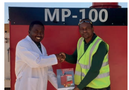
Our West Africa representative after delivering full training in the MP100

Although health benefits may not be widely associated with incineration, correct medical waste disposal helps save lives across developing countries. We have become the preferred supplier to international aid agencies, in turn leading to installations across dozens of sites, disposing of vaccine and hospital waste. 2021 brought home how essential it is for clinical waste to be disposed of correctly. Developing countries with poor facilities particularly feeling the impact of the tsunami of waste generated as a result of the pandemic. Since this time we have continued to prioritise the production of essential medical incinerators for these customers over all other orders.