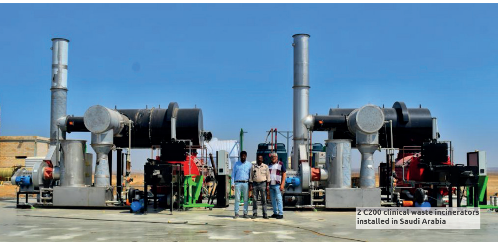
2 C200 clinical waste incinerators installed in Saudi Arabia

Already integrating future sustainability into our business plan to continue growing the business. Regularly reviewing markets to be explored, checking levels of maturity and incorporating these correspondingly. Building opportunities over a period of time whilst maintaining our stable markets.