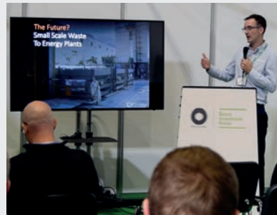
Delivering insights on Waste to Energy to industry peers.