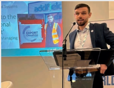
Promoting post Brexit exporting for the Chamber of Commerce.